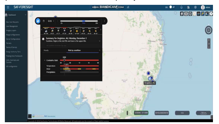
Weatherverse Planner plug-in UI example

Weatherverse streamlines this task through its utilization of extensive, top-tier data sets customized to your unique needs, all while pinpointing and drawing your attention to potential uncertainties that require your consideration.