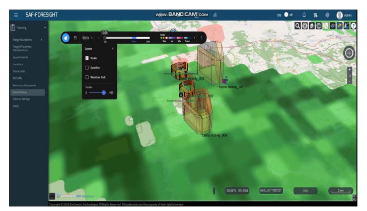
Weatherverse Planner plug-in UI example

Weatherverse Planner uses near real-time weather data and triggers that can be configured to align with your operations and assets, such as defining thresholds for conditions like lightning, wind or precipitation. When your thresholds are met, triggers automatically alert decision-makers to support up-to-the-minute awareness alleviating the need to monitor day-to-day or hour-tohour activity.